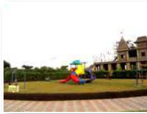
5.4 acres Central Park

This floor plan is indicative and is subject to change as decided by the company or by any competent authority in the best interests of developments.