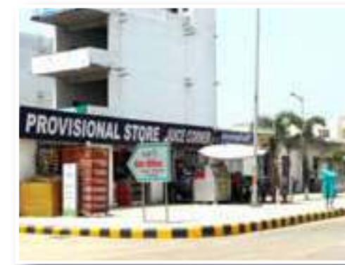
Daily Need Shops