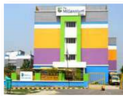
The Millennium School